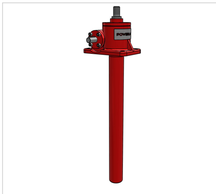
Configured Product Image