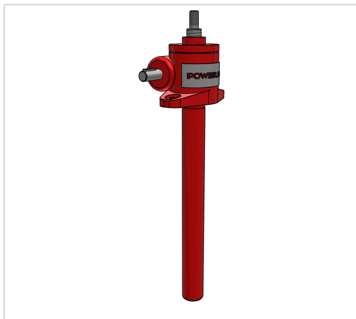
Configured Product Image