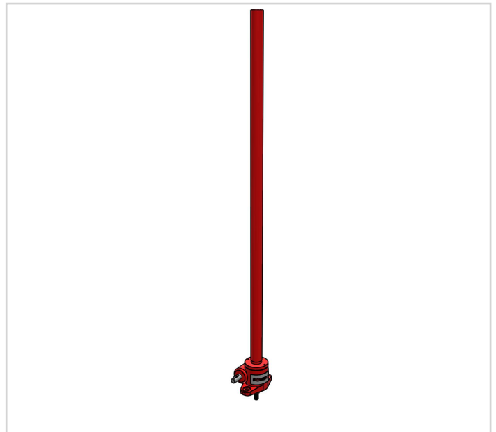
Configured Product Image