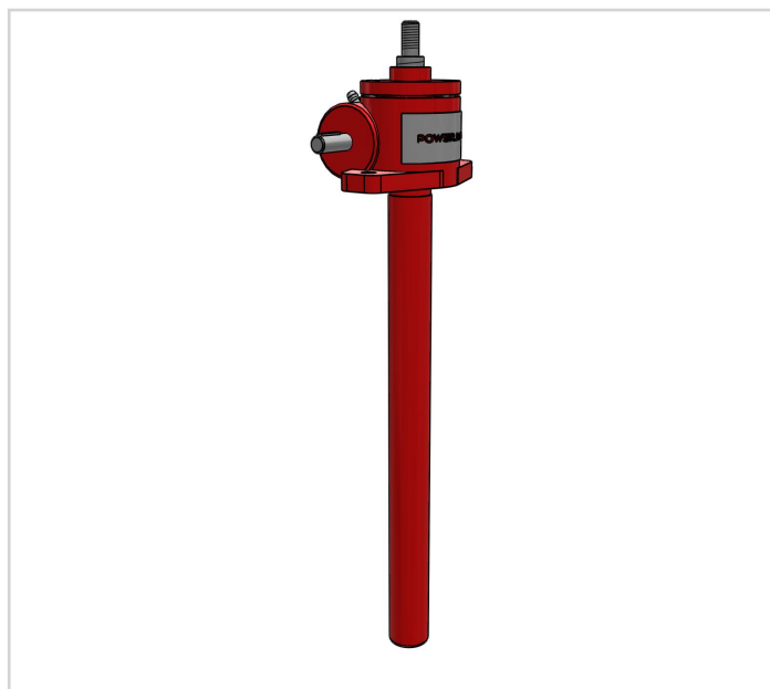
Configured Product Image